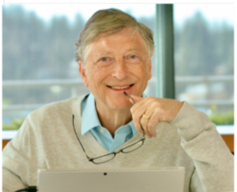
Imposter January 22, 2021