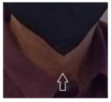
Visible Adam's Apple

The right ear of the imposter is quite different from the right ear of Bill Gates. One could argue it is due to the mask that is pulling on the ear. But that explanation does not explain the striking difference between the distinctive neck of Bill Gates and the imposter.